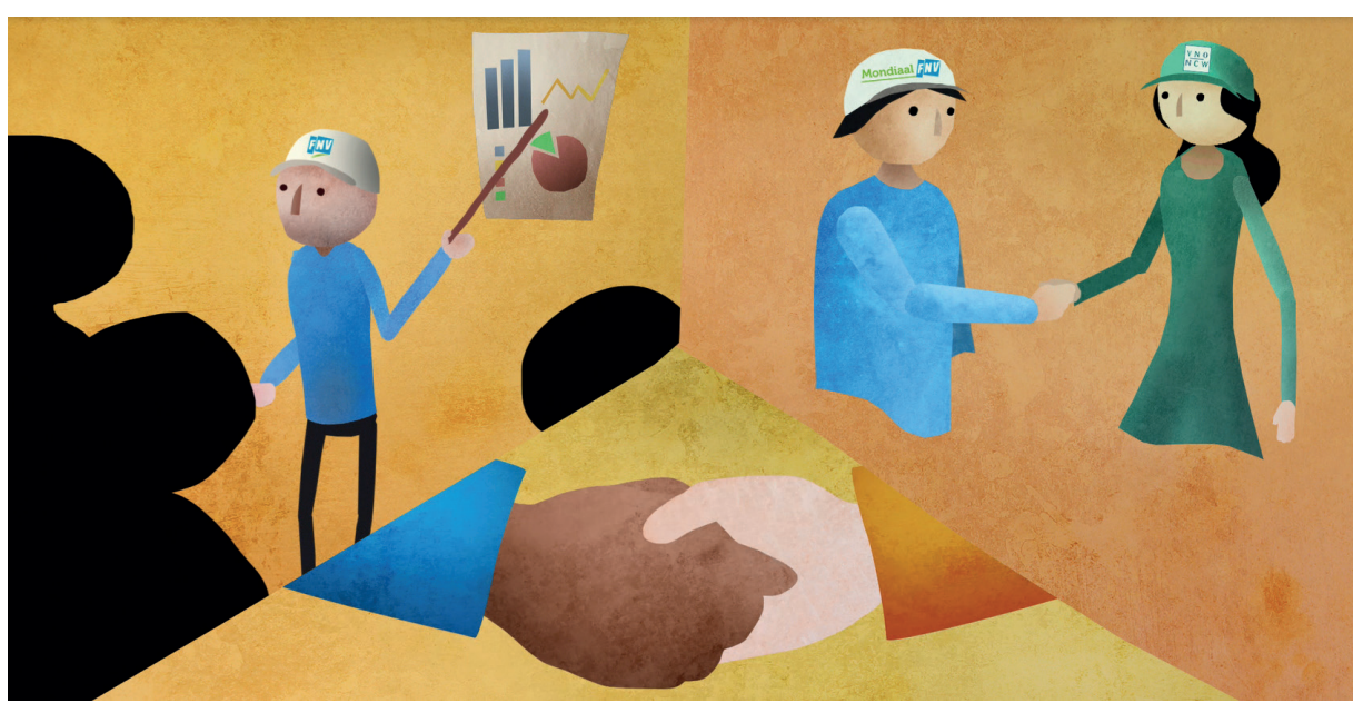
Animation: Cooler Media

Gender is an important focal point within the social dialogue programme: How are the interests of women workers represented in the dialogue or negotiation? Do the analyses or proposals take these into account? Are women involved in the process? There is also attention for the manner in which people without a fixed contract and/or people in the informal economy can be represented in the dialogue.