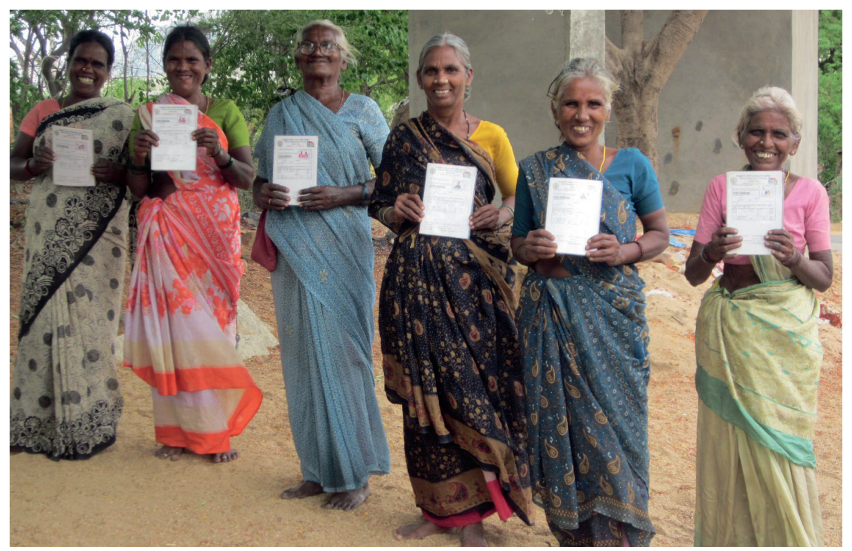
Female farm labourers in India receive health insurance