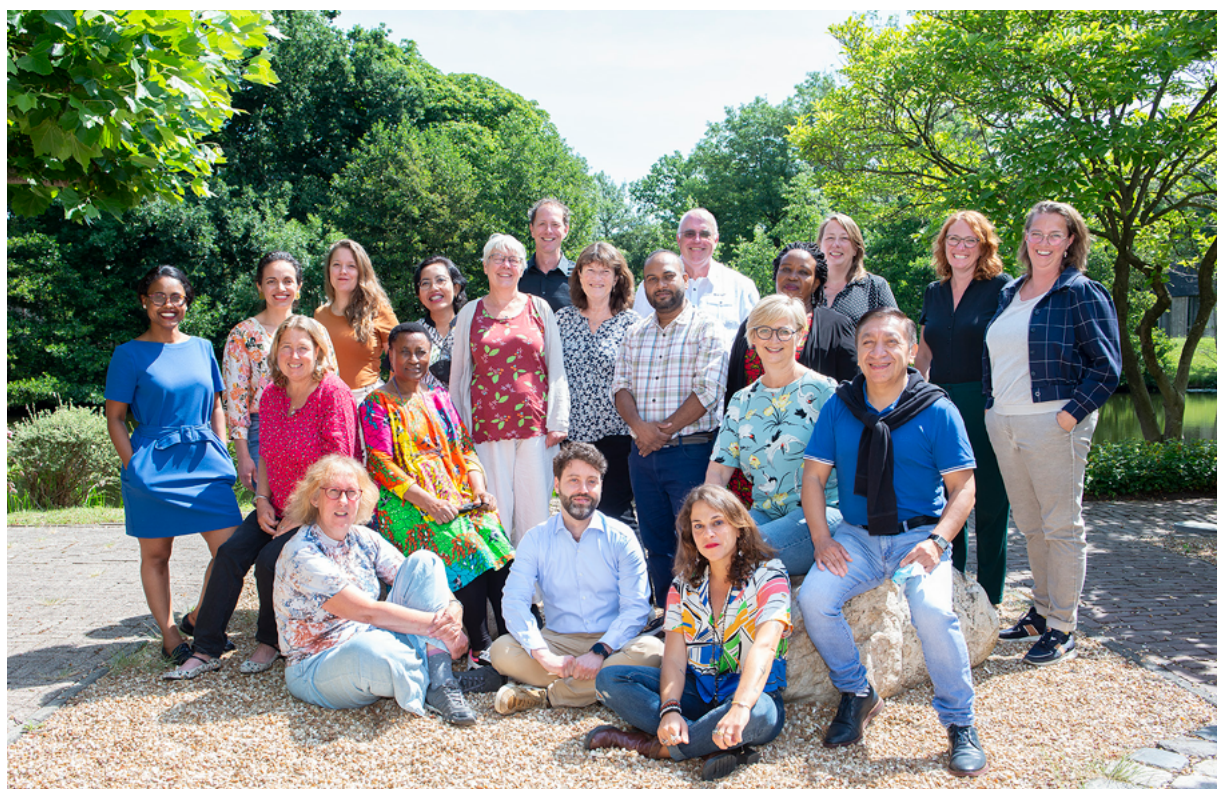
Mondiaal FNV staff and consultants during the Global Week 2022

In 2022, we worked with 183 international partners. Together, we improved the working conditions of 498,321 workers through collective bargaining agreements. We contributed to the improvement of labor laws for more than 33.36 million workers.