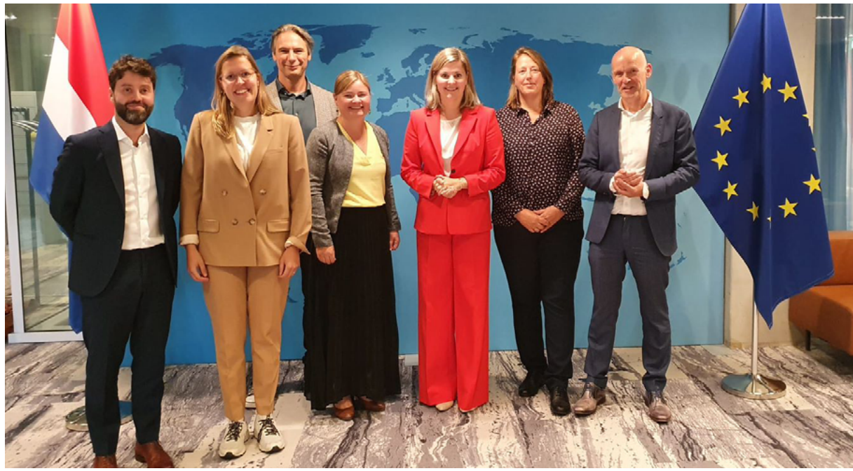
Personal meeting with minister Schreinemacher

In 2022, Mondiaal FNV took advantage of a number of opportunities to emphasise to Minister Schreinemacher of Foreign Trade and Development Cooperation the important role played by trade unions in combatting poverty & inequality and the development of fair trade and corporate social responsibility.