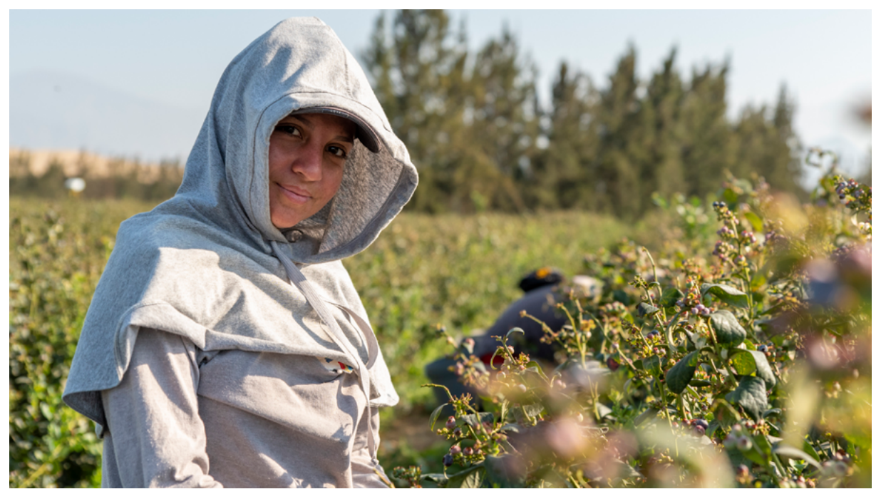
Woman harvests blueberries in Peru. In the fruit and vegetables programme in Peru, partners concluded four new company collective agreements.

Mondiaal FNV receives funds from the Trade Union Co-financing Programme (TUCP). This is a Dutch Ministry of Foreign Affairs programme, and its aim is to strengthen trade unions in low- and middle-income countries.