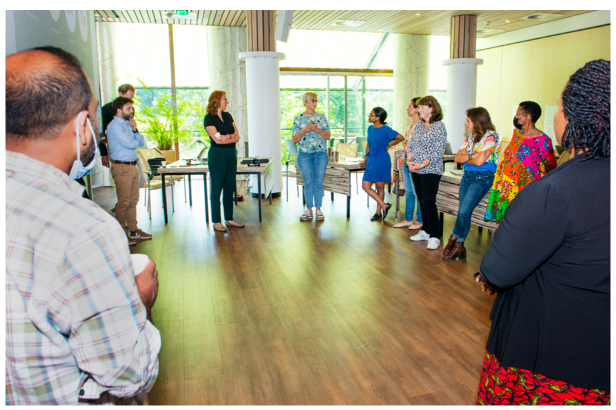
Mondiaal FNV staff in a workshop during the Global Week 2022.

In the social report of 2022 we look back at the developments within the work organisation of Mondiaal FNV