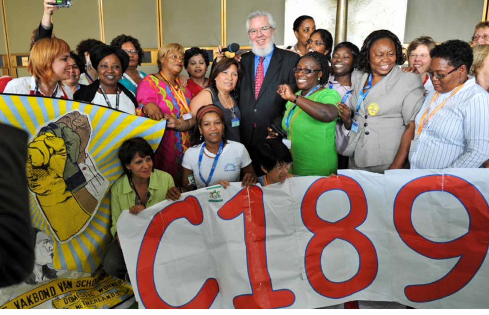
A group of domestic workers and the Director General of the ILO, Juan Somavia, together celebrate the result of the vote on the Domestic Workers' Convention.