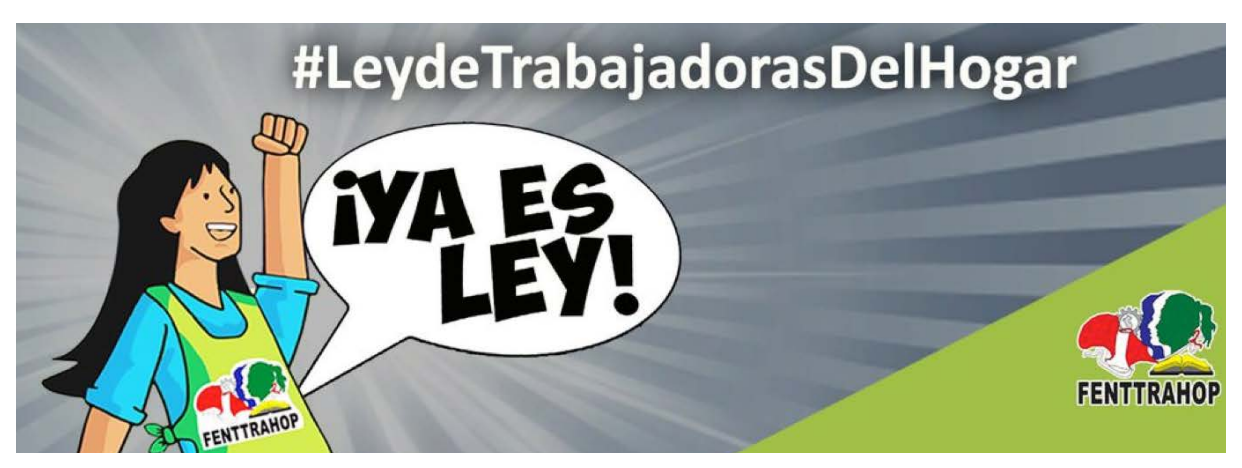
Domestic workers in Peru celebrate the adoption of a law