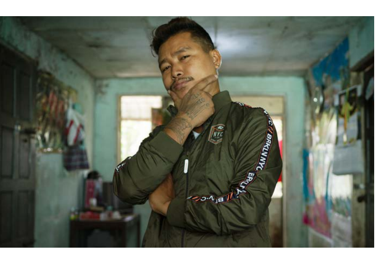
Photo from the series 'Made by Me' by photographer Chris de Bode on garment workers in Myanmar.

In the fight against child labour the Bangladesh Labour Foundation, our partner in Bangladesh, has managed to get the notorious 'sweatshop neighbourhood' Keraniganj in the Bengalese capital of Dhaka identified as a priority zone for the eradication of child labour. In this neighbourhood, many children are at work in the garment industry. The fact that the government has included this neighbourhood in a national plan to fight child labour is extremely good news.